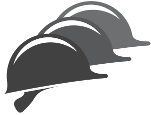
Outsourced Construction Site professionals