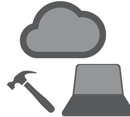
Outsourced Construction Management