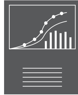
Outsourced Scheduling and Progress Reporting