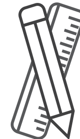
According to Your Needs