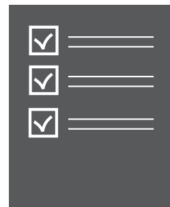
Outsourced Quality Control